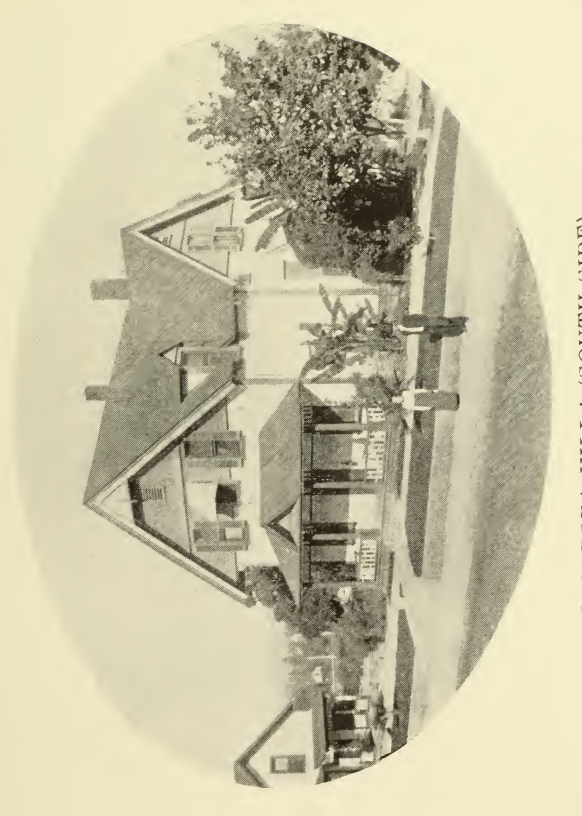
DIASPORA VILLA (SOUTH SIDE).