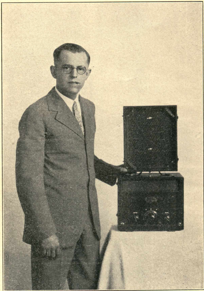
THE FIVE TUBE PORTABLE RADIO RECEIVER