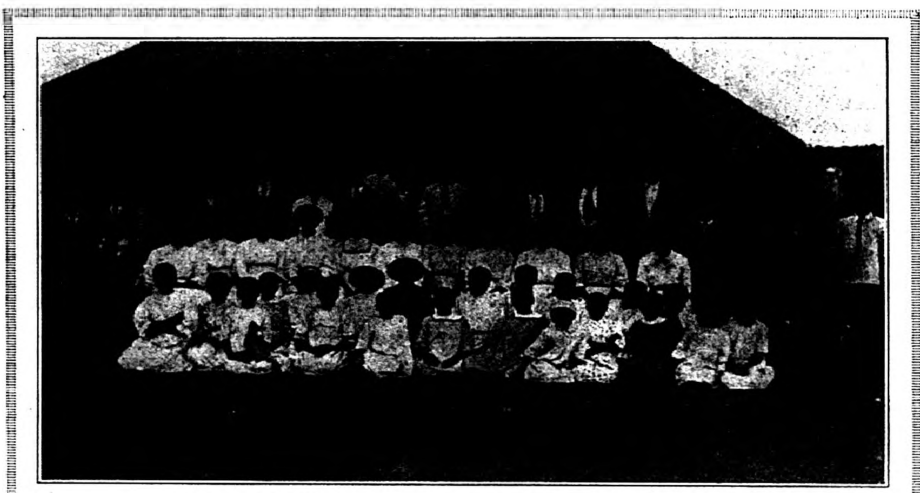
DAY SCHOOL at Grace Mission Station, Africa. If you desire to help support any of these boys or girls, send a remittance. It will be much appreciated.

and we are believing that God is going to add a number more before the Lord comes. We are having cottage meetings