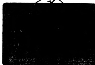
No. 200. Favorite Texts

These mottoes will bring cheer and comfort to any home. We are making a special price of 40 cents for one each of the four.