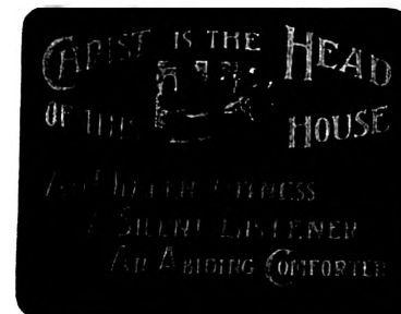
No. 100. Christ the Head

Size 5 x 7 inches. 5 cents each, postpaid.