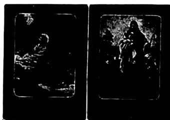
No. 250. The Comforter

Size, 5 x 6 1/4 inches. 5 cents each, postpaid.