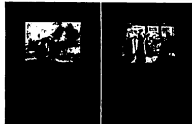
No. 280. Loving Kindness