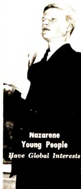
Nazarene Young People Have Global Interests

LATIN AMERICA N.Y.P.S. Youth Week Project