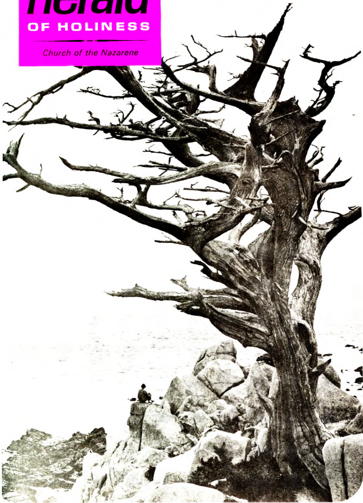
A gnarled cypress overlooks the Pacific