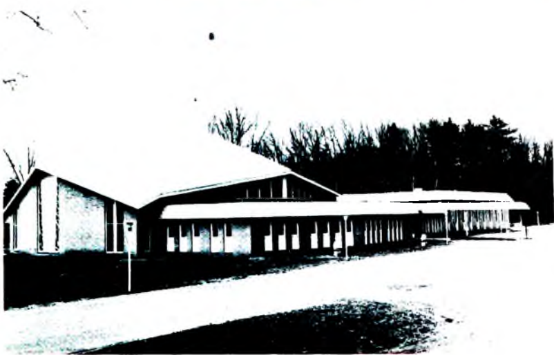
Lowell (Mass.) First Church