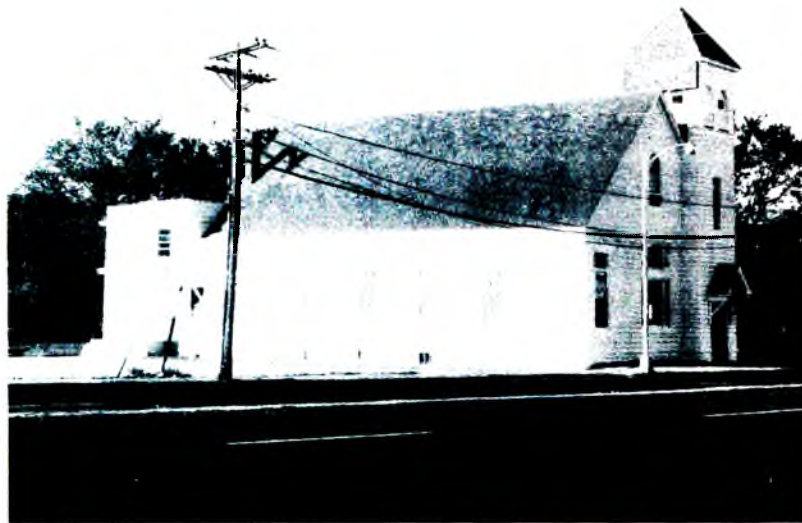
Lowell (Mass.) Spanish Church