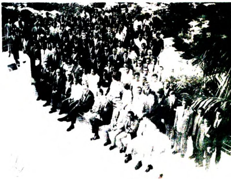
Pictured are the participants at the Caribbean Pastors' Conference

The denominational programs for Christian Service Training and