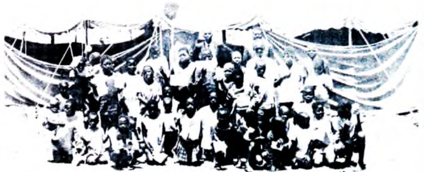
The first tent campaign held at Mothutlung, Africa, was attended nightly by service crowds ranging from 50 to 200. Pictured is the small group present the first Sunday morning.