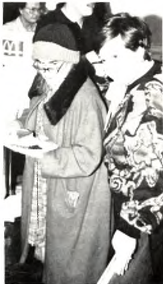
A volunteer (r.) helps an elderly lady find a place to sit.