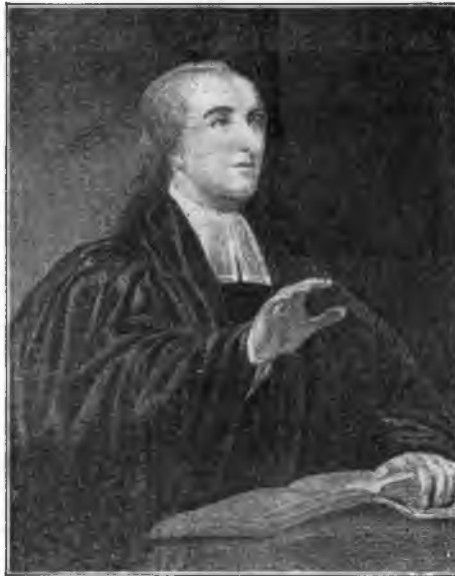
John Fletcher 1729—1785

NAZARENE PUBLISHING HOUSE, KANSAS CITY, MO.